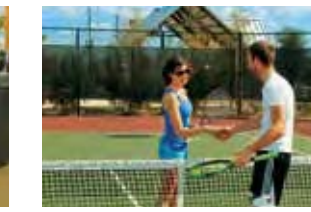
ARBOR SPORTS PARK