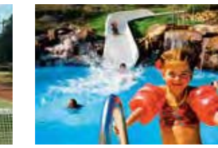
ADVENTURE ISLAND WATER PARK