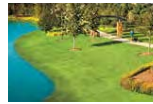
HIKE & BIKE TRAILS

Copyright ©2012 CCR TEXAS HOLDINGS LP. The information on this material may include inaccuracies or typographical errors. Plans, pricing and availability are subject to change without notice. Square footage is approximate. Maps not to scale and are for illustration purposes only, based upon current development concepts, which are subject to change without notice. No guarantee is made that the features depicted will be built, or, if built, will be as depicted. Photographs shown on this site are representative of the community and do not all depict locations in the community. January 2013.